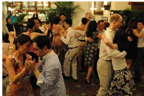
▲ The students are practising Tango dance.