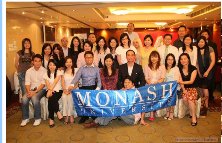
▲ We have a group dinner in a Chinese restaurant following Happy Hour Party. So nice to see you all smiling!