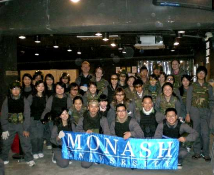
◀ The war game team members took a group photo.