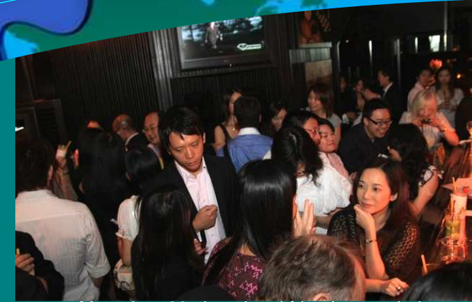
▲ More than 80 alumni and friends attended MUHKAA Happy Hour Drink Party on 5 June..