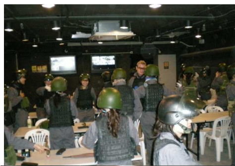
◀ Get ready for the game?