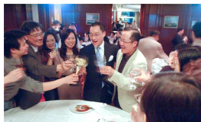
▲ Congratulation to the new FAAA committee!