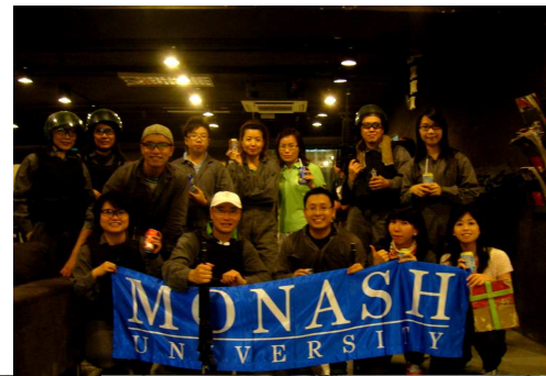
◀ The war game winners took a group photo.