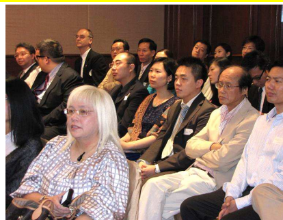
▲ The audiences are so excited to vote for the election of new FAAA committee members.

November 2009 (TBC) Host an event for Monash University Vice Chancellor's visit to Hong Kong (To be announced) Hong Kong